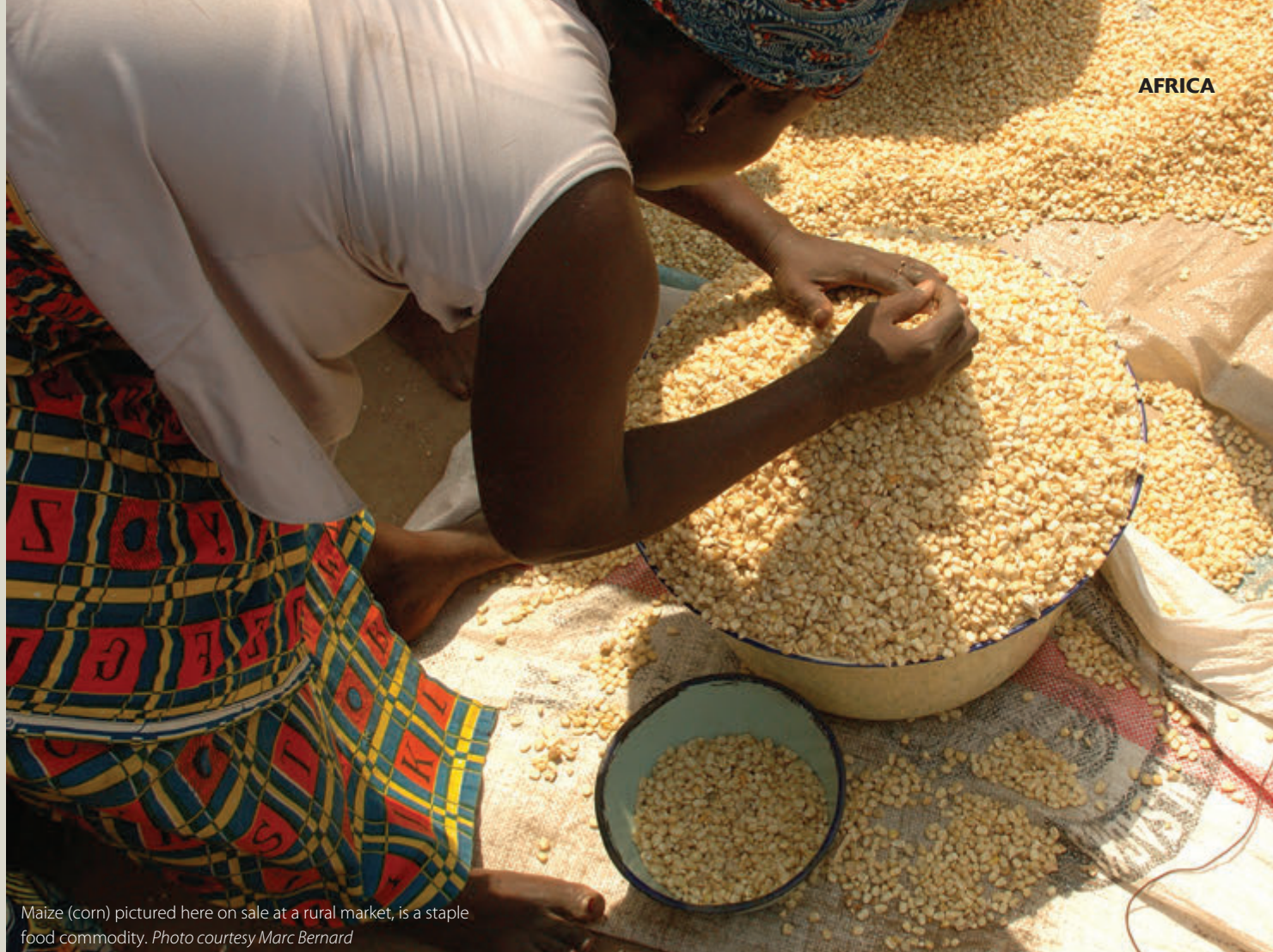
Maize (corn) pictured here on sale at a rural market, is a staple food commodity.