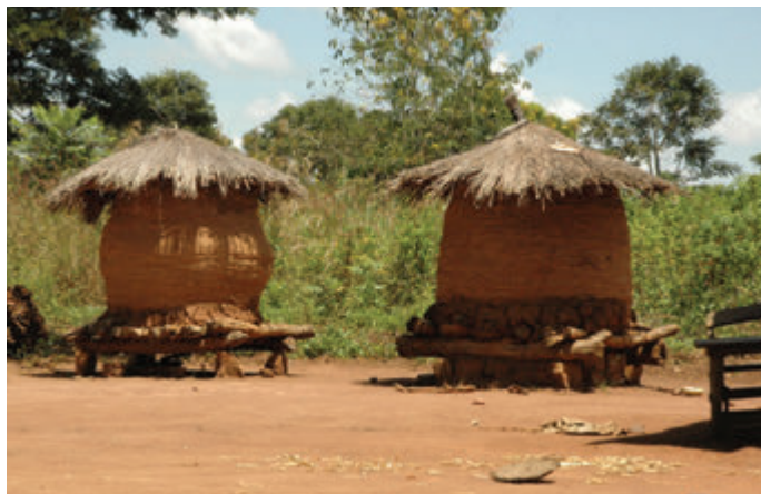
Traditional store for cereals in the Soroti district (Uganda).